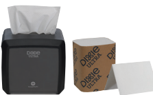
Dixie Ultra® Tabletop Interfold Napkin Dispenser