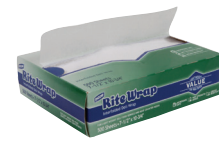
Dixie® Rite-Wrap® Interfolded Light Weight Dry Waxed Deli Paper