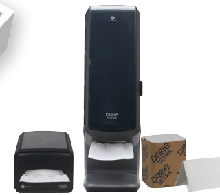
Dixie Ultra® Tower Interfold Napkin Dispenser