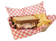
Dixie® Food Shop® Foodwrap, Red Check