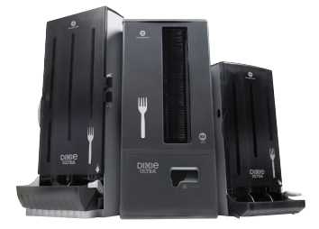
Dixie Ultra™ SmartStock® Cutlery Dispensers