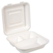
Dixie® 3-Compartment Molded Fiber Clamshell